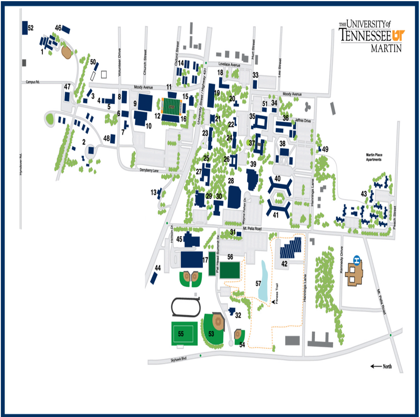
Kathleen & Tom Elam Center #17