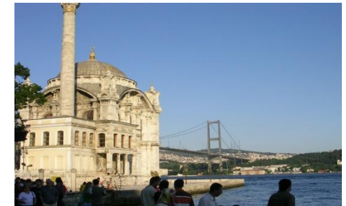
Top, left to right: Hellenistic ruins at Ephesus; Santorini; the Parthenon, Athens. Bottom, left to right: Hagia Sophia, Suleymaniye Mosque, Ortakoy – all in Istanbul

Explore two great civilizations! Greece, the cradle of western civilization, gave us Homer, Plato, Aristotle, Alexander the Great, and democracy. Greek culture has influenced European and Asian history from the Atlantic to Afghanistan. The beauty of her landscape, her classical ruins, and her deep blue Aegean Sea are unsurpassed. Turkey is history's great crossroad bridging Europe and Asia: 2500 years ago Persian king Darius conquered the area; 2300 years ago Alexander built his Hellenistic empire in Turkey; 2000 years ago St. Paul preached the Gospels throughout Turkey; 1700 years ago Roman Emperor Constantine made Istanbul the capital of the Roman and Byzantine empires. 500 years ago the Ottomans ruled the Islamic world from Turkey and made Istanbul Europe's most powerful city. Today Istanbul remains one of the world's most vibrant cities.