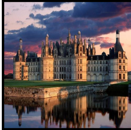
Loire Valley Castles