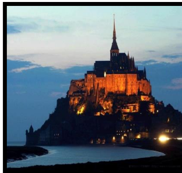
Mont Saint Michel