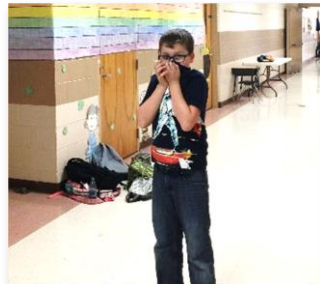
Well, almost everyone!