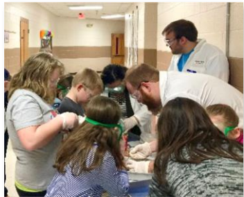
Everyone's in on the action!

The hands-on learning experience about arteries, veins, ventricles and valves was followed by a quiz on what activities promote a healthy heart — what keeps it beating and what causes it damage, e.g. meatlover's pizza vs kale, regular exercise vs being a couch potato?