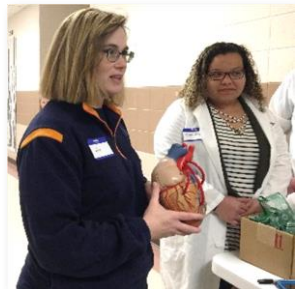
...and that causes a heart attack!