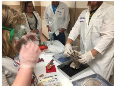
The heart is a muscle!