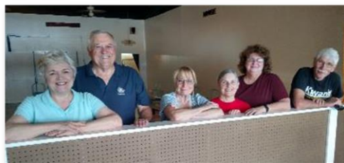
Thursday evening contingent