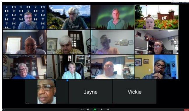
Fourteen members zoomed into last week's meeting of Kiwanis!