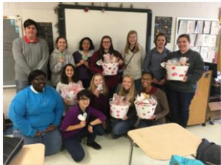
Westview Key Club members are pictured with appreciation valentines they distributed to police, firemen, and Air Evac employees.

The Board Member application is available on the district web site under the LaMissTenn Foundation tab. Applications must be received by June 1st.