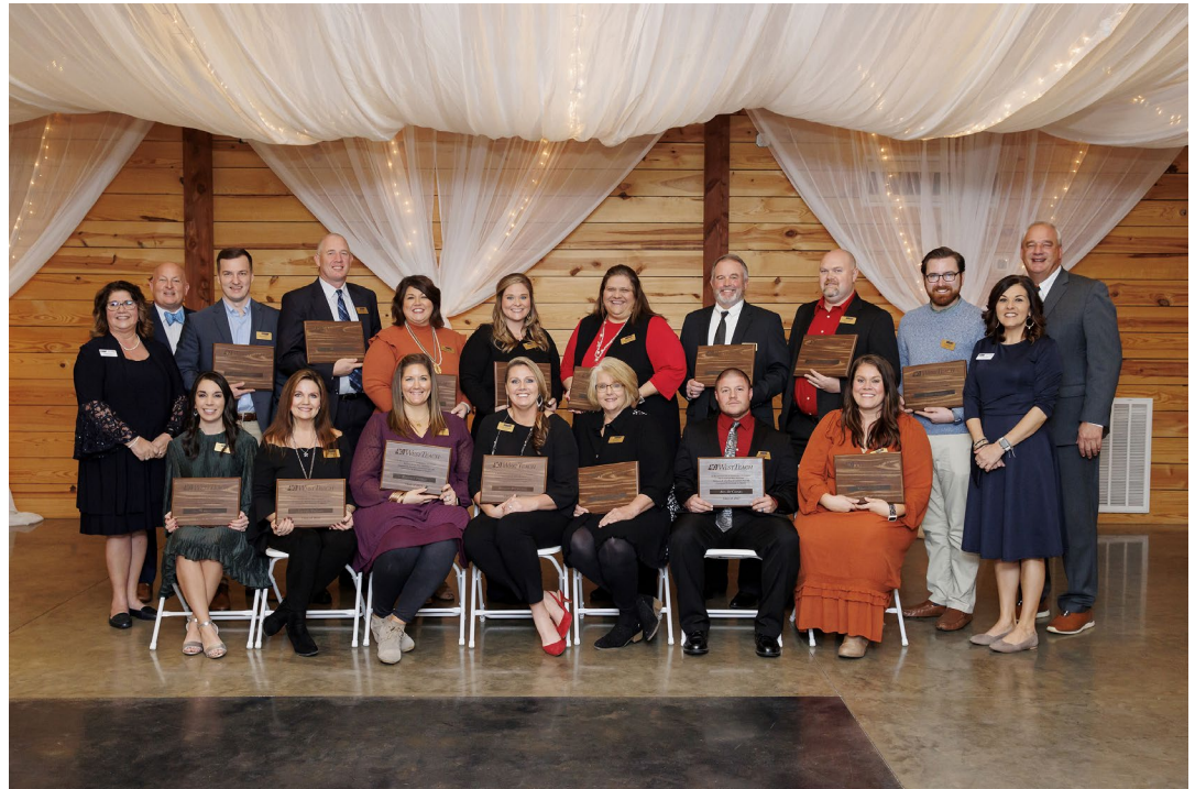
The WestTeach class of 2021 is pictured following its December graduation in Jackson.

The WestTeach mission is to engage and equip West