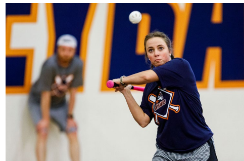
I Heart UTM Week was filled with activities for students, faculty and staff. Highlights included (from the top, l-r) Doughnuts for Donors, a crawfish boil, Dog Days, a Yung Gravy concert and the annual SGA Faculty/Staff vs. Students softball game.