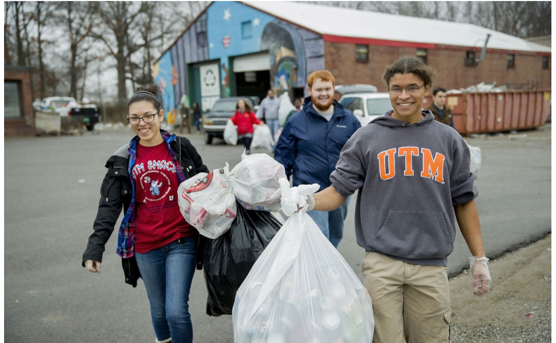
Students participate in a day of service at the UT Martin Recycling Facility. The UTM Center for Sustainability will award two Campus Sustainability Grants to campus organizations.

Campus Sustainability Grants are awarded yearly to the student group with the strongest proposal for a sustainability-related project on campus. Applications for next year's grants are due by March 1, 2023, and projects must be carried out during the 2023-2024 academic year. The application can be found at www.utm.edu/sustainability/grantprogram.php .