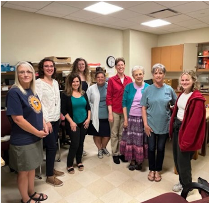
BOOK REPAIR WORKSHOP – While the Paul Meek Library continues to adjust its balance of print and digital resources, maintaining its existing print collections is a constant challenge. Rhodes college recently hosted a group of library faculty and staff for a book repair workshop. They learned techniques for simple book repairs, creating tip-ins and cover pages, to more extensive repairs to damaged spines and re-casing entire books. Staff have begun implementing these practices, which help reduce replacement costs for heavily used monographs.