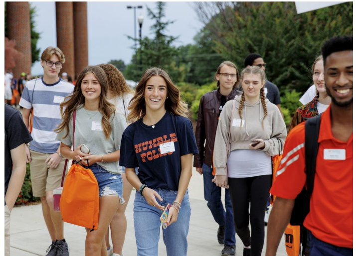
FALL PREVIEW DAYS – Students visit the UT Martin campus for Student Orientation and Registration (SOAR) on June 10, 2022. UT Martin invites all high school students and their families to attend Fall Preview Days on Sept. 24 or Nov. 12 to find out what it means to be a Skyhawk.

Pre-registration is encouraged to ensure that each student can visit areas of personal interest. Registration can be completed online at www.utm.edu/preview . For more information, contact the UT Martin Office of Undergraduate Admissions at (731)-881-7020 or admitme@utm.edu .