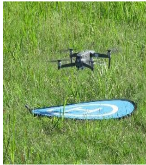
TGSAS scholars learned first-hand about Unmanned Aerial Vehicles (UAV) technology.