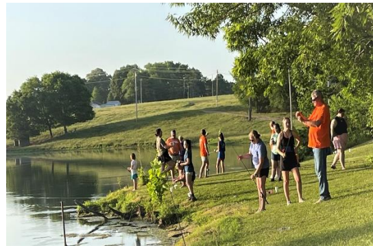
Fishing at Middle TN UT Ag Research Institute of AG