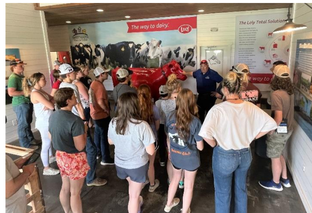
Sweet Water Valley Farms