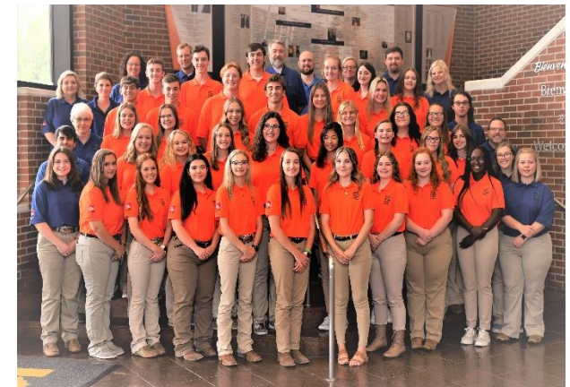
Governor Scholars Class of 2022

For additional information visit our website: https://www.utm.edu/offices-and-services/the-tennessee-governor-school-for-the-agricultural-sciences/