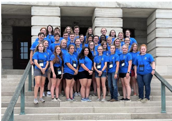
On the steps of the State Capital