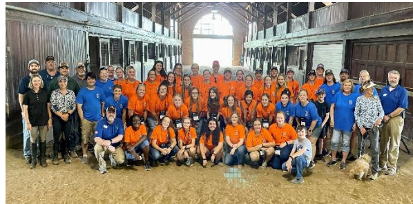
A visit to Wildwood Farm in Germantown