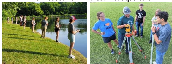
Fishing at Middle TN UT Ag Research Institute of AG