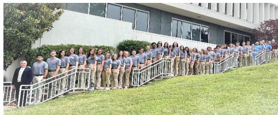
Tennessee Farm Bureau Headquarters