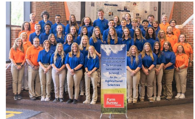
Governor School Scholars Class of 2023

For additional information visit our website: